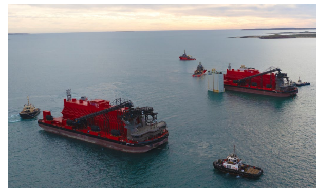
First two transhippers at the Port of Dampier