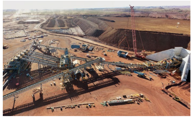
Ken's Bore crushing plant Train 3