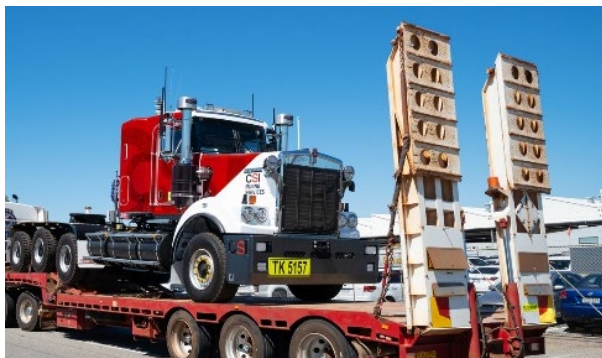
First autonomous road trains delivered to Onslow