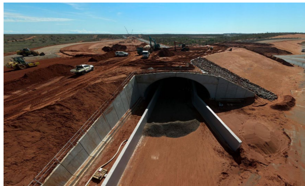
Haul road at Warrirda/Onslow Rd overpass