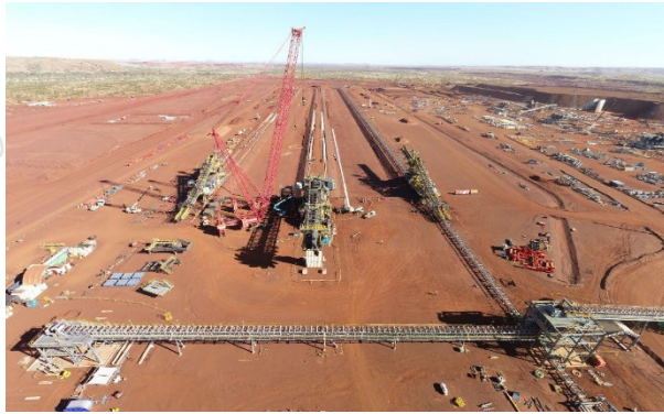
Stacker and reclaimer assembly ongoing