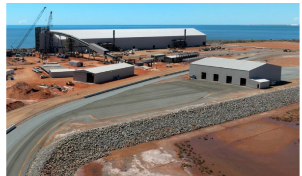
Product storage facilities at Port of Ashburton