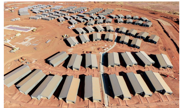
Ken's Bore Resort accommodation