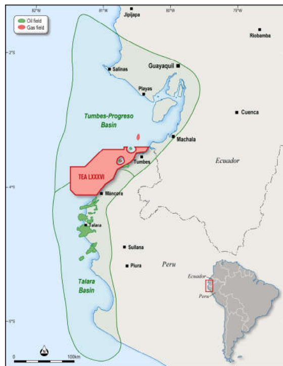
Figure 1 – Tumbes Basin TEA area in northern Peru.

Global Oil and Gas Limited (ASX: GLV) ( Global or Company ) is pleased to provide the following activities report for the quarter ending 31 December 2023.