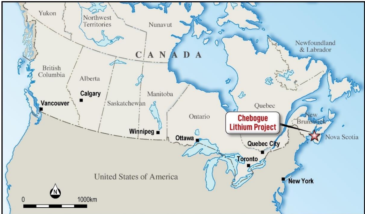
Figure 1- Location map of Chebogue Lithium Project

The Company believes that similar, NE oriented (~050°), spodumene-bearing pegmatites may occur further to the north and south of Brazil Lake along a northeast trending (~020°) stratigraphic sequence of metavolcanics and metasediments. This sequence of up to ~4 kilometres wide, runs parallel to, and to the west of the Chebogue Point Shear Zone.