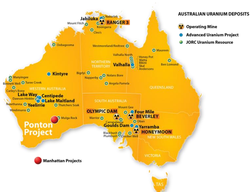
Figure 3- Ponton Project Location

1 https://deepyellow.com.au/projects/australia/mulga-rock-project/