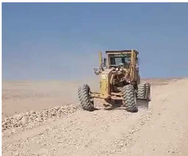
Figure 3: Work on access track improvements in-progress.

During the quarter, work was undertaken to enhance the access into the project to permit easier transport and it is progressing well (Figure 3). Completion of track repairs, building a camp, creating improved access to Muvero, and excavating additional cut-and-fill drill pads will follow once access routes have been upgraded.