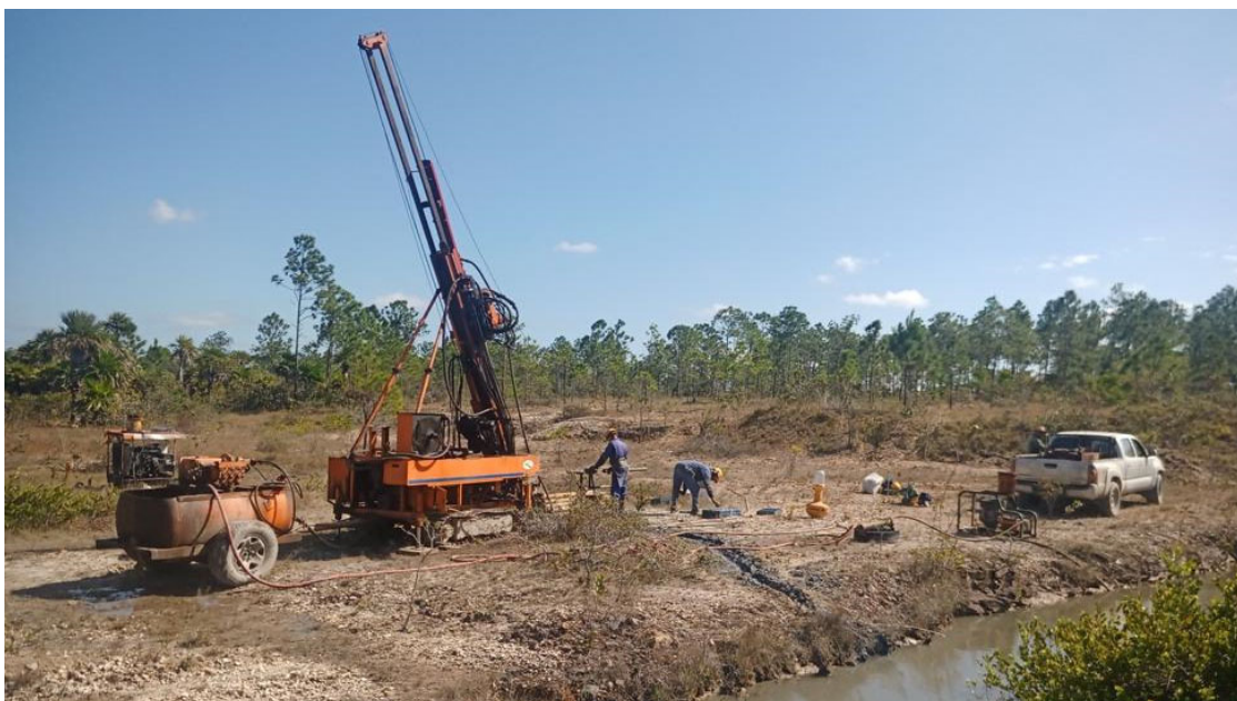
Drilling - El Pilar