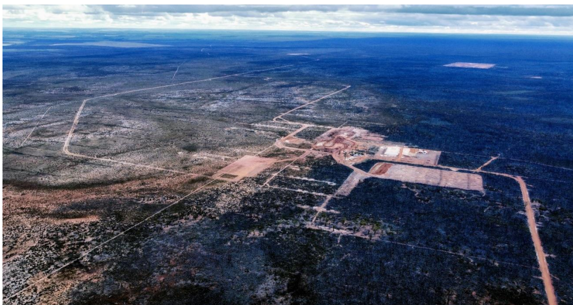
Figure 1 Kat Gap mine site

The Company continued during the quarter to bring the Kat Gap gold project closer to full scale production. Most of the work was focused primarily on the trial mining activities. This included the calibration of the Kat Gap processing facility to capture data enabling refinement of the gravity circuit operation.