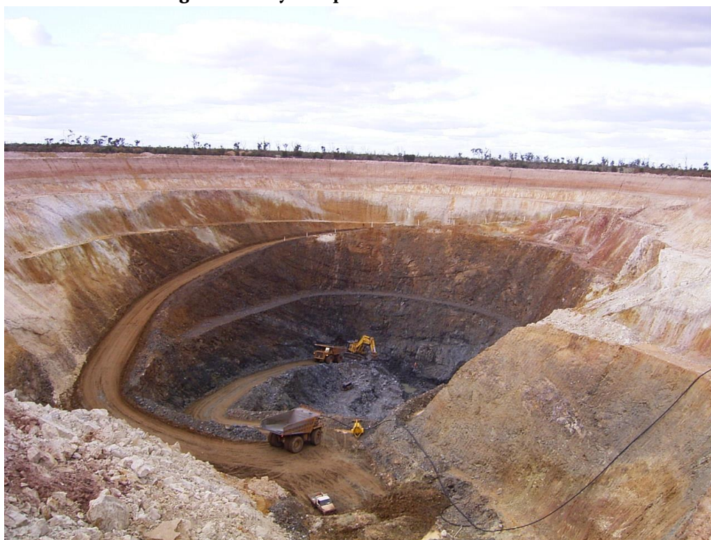
Figure 3: Lady Ada pit on the FGP tenements

Although the FGP Tenements already host a substantial 300,000 ounces of gold, the exceptional exploration potential within this area provides a huge opportunity for the discovery of additional gold ounces outside of the existing indicated and inferred resource base. The historical success of the Forrestania region in hosting significant gold reserves, contributed by various successful mining companies, adds to the significant potential of the area. Classic's 100% control of its own processing facility in the area further positions the company to efficiently explore and process gold resources not only from Kat Gap but also from within the larger Forrestania tenement package. This strategic ownership of all assets grants Classic full autonomy and control over their mining operations, enabling streamlined processes and maximizing returns from their gold projects, reinforcing their position within our WA gold mining industry.