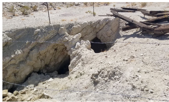
Figures 4 & 5: Argos Trench, looking west and historical celestite workings (Source Gregg Wilkerson, April 2021) 5